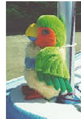
The Pirates Parrot