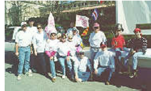
The Cherry Blossom Festival Parade Crew

Ask for a MUGRACE Program and tell them you are interested in sailing with what kind of boat. (Builder, Size, Boat Name, etc.)